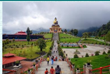
Khangchendzonga National Park